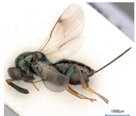
Female of Monodontomerus sp., taken on the Keyence digital microscope by Timea Szikora during the parasitic Hymenoptera course.