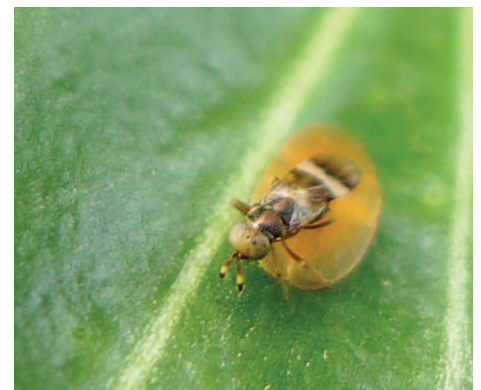
Encyrtid ovipositing.