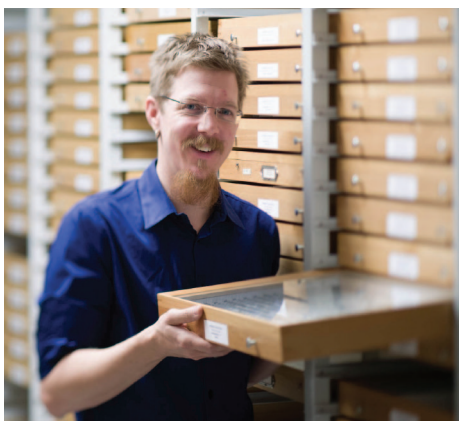
The new curator at UMB (Photo: M. Haase, © Übersee-Museum Bremen).