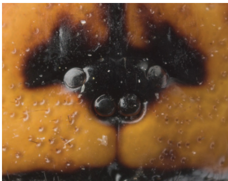
Gosh! 1, 2... 4 ocelli!!! What a weird wasp!!!.