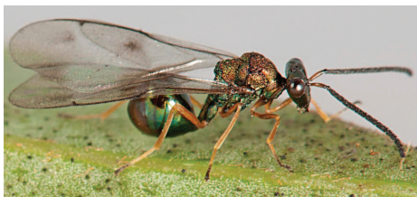
Orasema (Eucharitidae) female on Myrsine