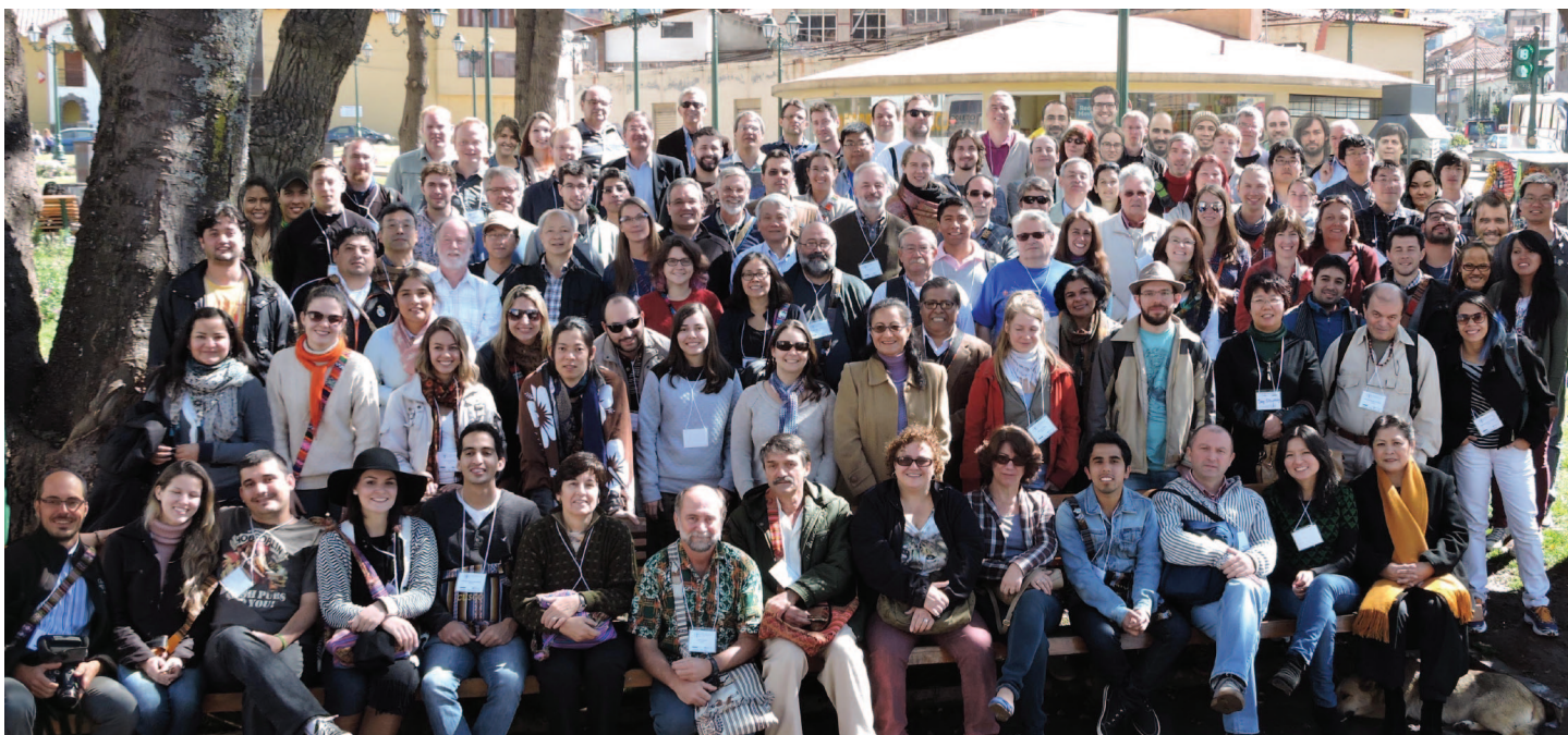
8th International Congress of Hymenopterists.