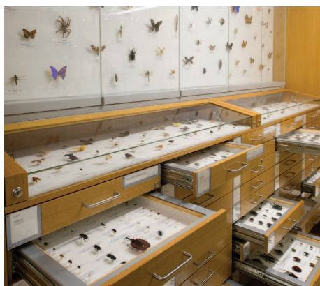
A reference collection as part of the permanent exhibition.

Beside these ~56,000 catalogued specimens there are still ten thousands of wasps in alcohol (e.g. from Northwest Germany and expeditions to Papua New Guinea and Costa Rica) waiting for preparation and identification – Microhymenoptera in particular. If you are interested in getting further information on the collection, visiting our museum, requesting a loan, or finding a place to deposit your (para-) types and other material please drop me a short line.