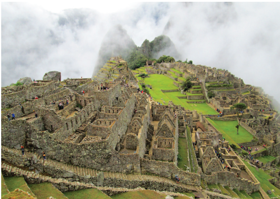
Machu Picchu, near Cusco, Peru, site of the 8th International Congress of Hymenopterists.