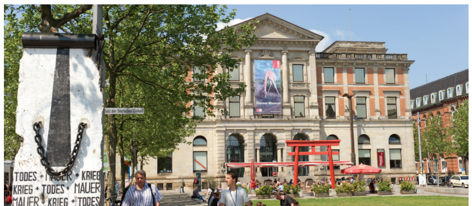
Historic building of the UMB (a part of the Berlin Wall on the left) (Photo: M. Haase, © Übersee-Museum Bremen).